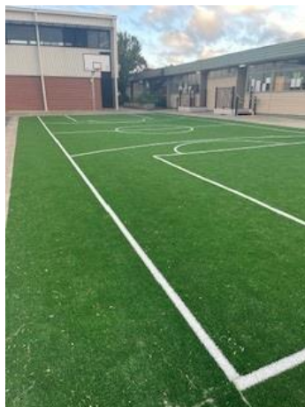
Year 3 / 4 Basketball court